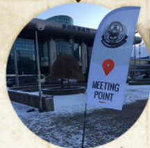
MEETING POINT IN KIEV (8 AM)