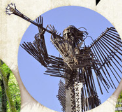
WOODWORM STAR MEMORIAL