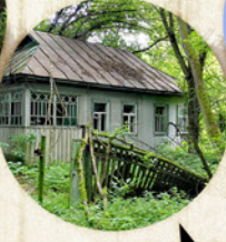
OLD CHERNOBYL STREET