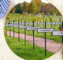
"ALLEY OF MEMORY AND HOPE"