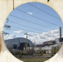
PANAROMA VIEW OF CHERNOBYL POWER PLANT