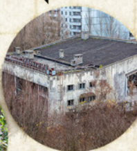
SWIMMING POOL "LAZURNIY"