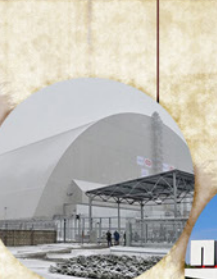
NEW SAFE CONFINEMENT SITE