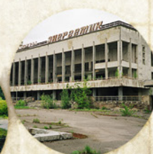
"ENERGETIC" PALACE OF CULTURE