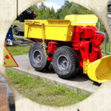
CHERNOBYL OPEN AIR MUSEUM OF MACHINERY