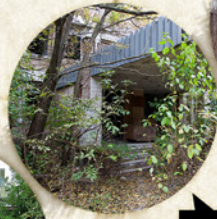
GRAMMAR SCHOOL #3