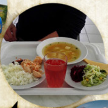
LUNCH BREAK AT THE POWER PLANT CANTINE