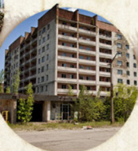
"RAINBOW" SHOPPING CENTER