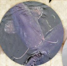
FEEDING GIANT CATFISH IN THE COOLING CHANNEL