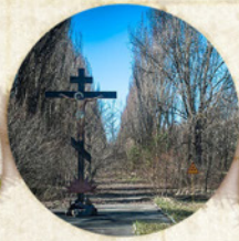
BOULEVARD OF LENIN