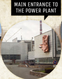
MAIN ENTRANCE TO THE POWER PLANT