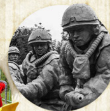
MONUMENT TO "THOSE WHO SAVED THE WORLD"