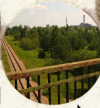
"BRIDGE OF DEATH"